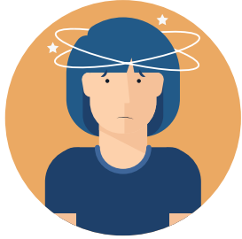
Headaches and dizziness