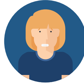
Jaw clenching and teeth grinding