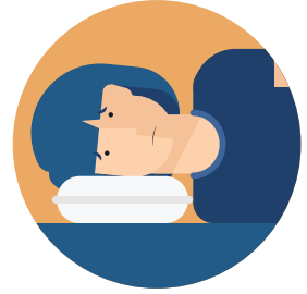
Insomnia (not sleeping well)

People can also experience a ' comedown ' after using ice, where they feel really low or depressed, exhausted, nervy, or anxious.